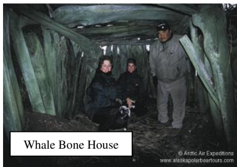
Whale Bone House

Note: Children must be 6 years of age or older. Guests will use what the Eskimos use for spring and summer transportation "ATVs" and you will be trained if you do not have experience with them. In the event of weather delays, meals and lodging will be extra. Guests are encouraged to be flexible and allow extra time with other air connections. Cannot travel to or from Point Hope on Sundays.